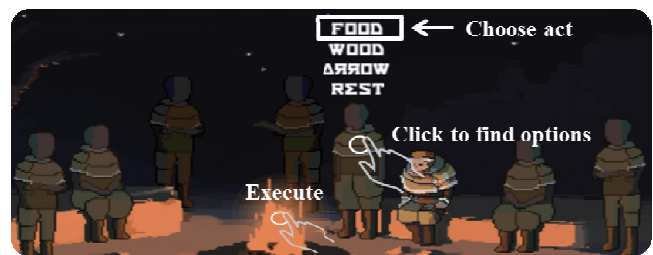
Figure 1 Selection of Player's Action

start of the day, the player has been given four task options which are hunt, wood, arrow and rest. Each act consumes the health of the player (HP). The player can decide what to do base on its resources. If the player wants to collect more food, the task is to hunt the monsters. The wood task is required to collect the woods and arrow making task is selected if the player has not enough arrows to hunt. Rest task is to reconcile the HP. These tasks can be selected by clicking at the character image in the game and then execution as can be seen Figure 1.